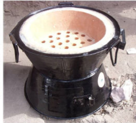
-Poupa Carvão – Mbaula.